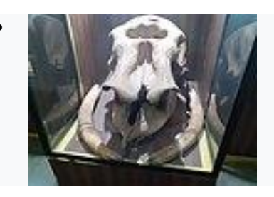
Skull of prehistoric elephant